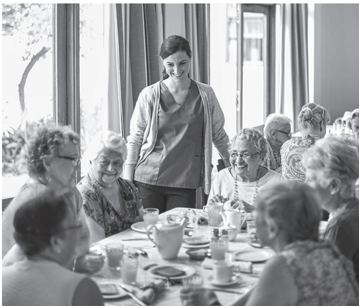
Aging brings about many changes, including some that may compromise seniors' ability to remain independent. In such instances, many families consider assisted living facilities for their aging relatives.