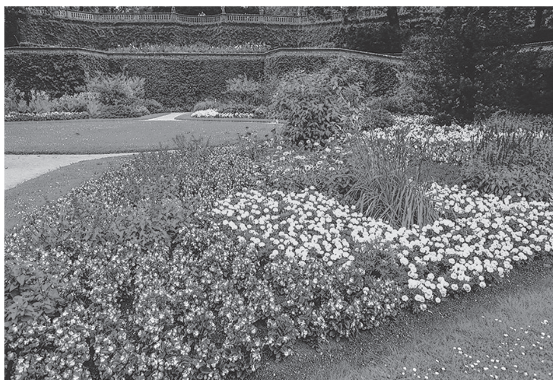
Whether you prefer soft pink, are partial to bright red or want to relax in a garden and gaze at something deep blue, chances are you'll find a perennial to tickle your fancy.

These colors are those that are next to each other on the color wheel, such as orange and red. The NGA recommends harmonious colors for gardeners looking to create a unifying feel in their gardens without resorting to a monochromatic color scheme. Harmonious colors give off a gentle feeling that can make for a relaxing garden atmosphere.