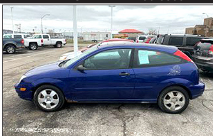
'05 FORD FOCUS #ZH59101B1, Blue $2,800