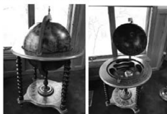
Medieval Period World Globe with Horoscope and Hidden Bar Compartment