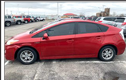
'10 TOYOTA PRIUS #ZJ03019B, Red $5,700