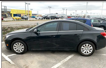
'11 CHEVY CRUZE #ZC43557B, 130K, Black $6,900