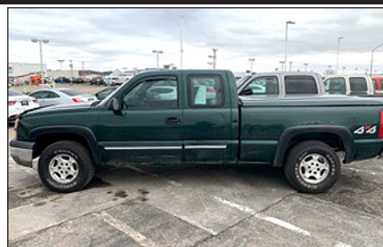
'03 CHEVY SILVERADO 1500 #ZN201222C, Green $4,600