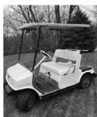
Yamaha Gas Golf Cart Around 1995 Very Good

KEEP WATCHING: auctionzip.com or auctionbill.com