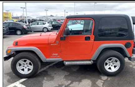
'05 JEEP WRANGLER #ZJ554406B, 119K, Orange $13,900