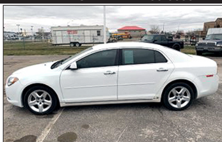
'12 CHEVY MALIBU #ZH9415B, White $4,900