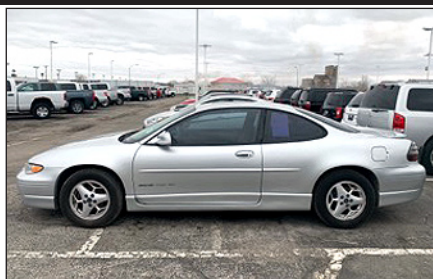
'02 PONTIAC GRAND PRIX #ZH9464A, Silver $4,700