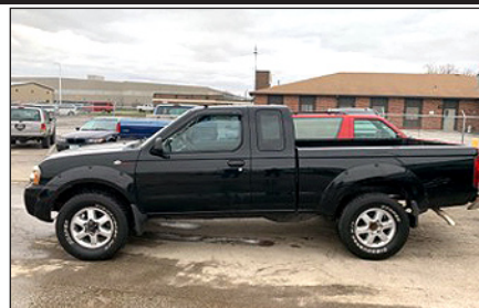
'04 NISSAN FRONTIER #ZXH59183C, Black $7,900