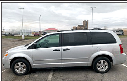
'08 DODGE CARAVAN #ZX28542B, Silver $4,500