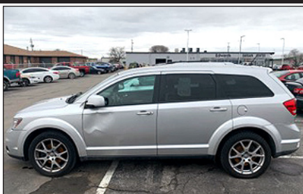
'13 DODGE JOURNEY #ZC43624A, Silver $7,600