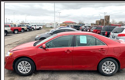
'14 TOYOTA CAMRY #ZN28597B, Red $5,800