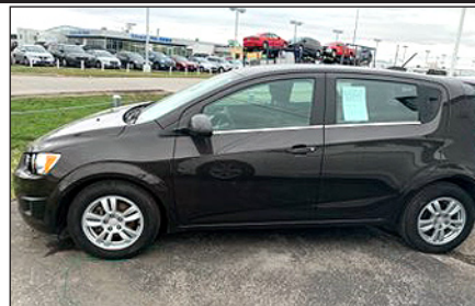
'15 CHEVY SONIC #ZM59367A, 75K, Black $10,000