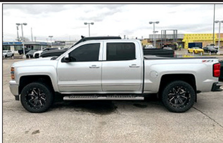
'14 CHEVY SILVERADO 1500 #ZC44180A, Silver $31,500