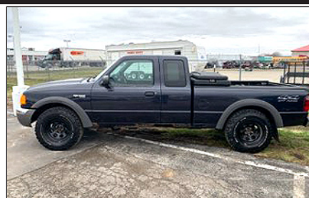
'01 FORD RANGER #ZK210845A, Blue $5,900