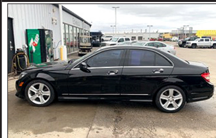
'11 MB C300 #ZH59419B, 121K, Black $12,900

View Our Entire Listing Of Bargain Center Cars Online