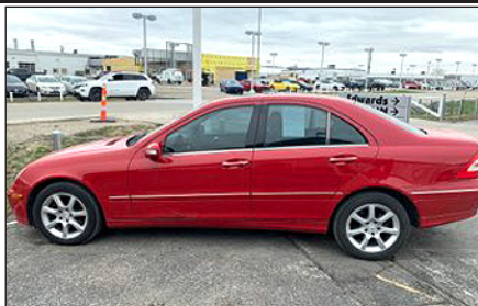
'07 MB C280 #ZH9488A, 111K, Red $5,500