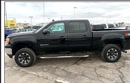
'11 GMC SIERRA 1500 #ZC44075A, Black $16,000