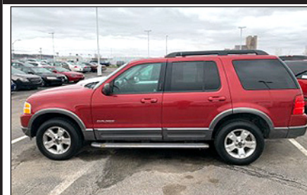
'05 FORD EXPLORER #ZK210413B, Red $2,500