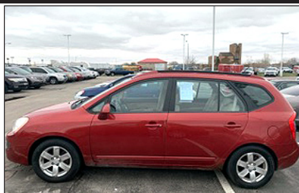
'07 KIA RONDO #ZJ993B, Red $4,500