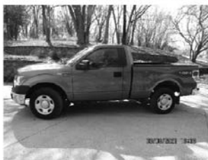
2009 Ford F-150, 4WD, (Sells at Noon) Only 32,500 Miles, New Tires