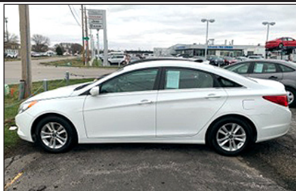
'13 HYUNDAI SONATA #ZN28558B, 110K, White $9,500